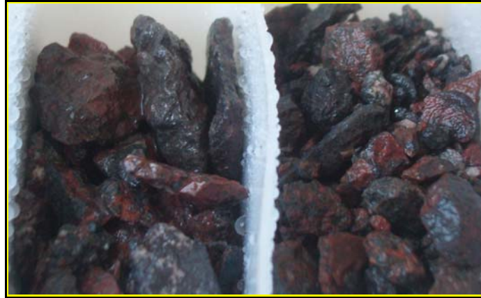
Figure 2. Magnetite and haematite alteration in drill chips from drillhole 08RCDU001

A program of 5 drillholes for 793 metres tested a variety of geophysical and geochemical anomalies over an area of approximately 2 x 1 kilometres (Table 1). The drillholes each penetrated a sedimentary sequence (siltstone, sandstone, quartzite) with widespread mixed magnetite and haematite alteration of varying intensity (Figure 2).